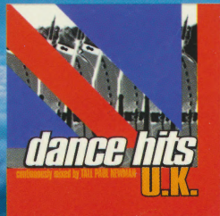
DANCE HITS U.K. MM 80015